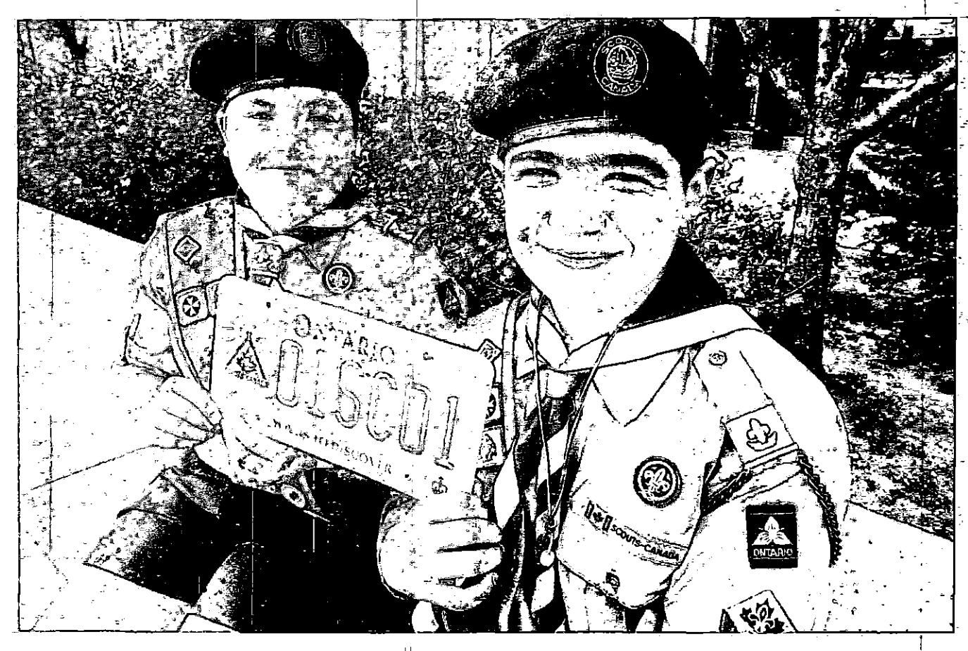
Ist Pickering Scouts assisted the Ministry of Transportation when our licence plates were unveiled at a Queen's Park ceremony this past summer. Since then, nearly 400 Scouters have taken this opportunity to promote Scouting in Ontario

In 1996 Blue Springs and Training Operations were accounted separately.